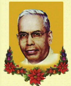
Dr. S. R. Ranganathan Father of Library Science in India