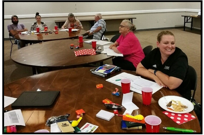
Financial Fitness participants at the Donald W Reynolds Library in Durant enjoyed the presentation and the refreshments.