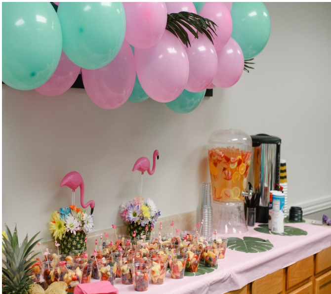
Beautiful decorations, cookies, tea, fruit infused water, and fruit cups provided a festive atmosphere.