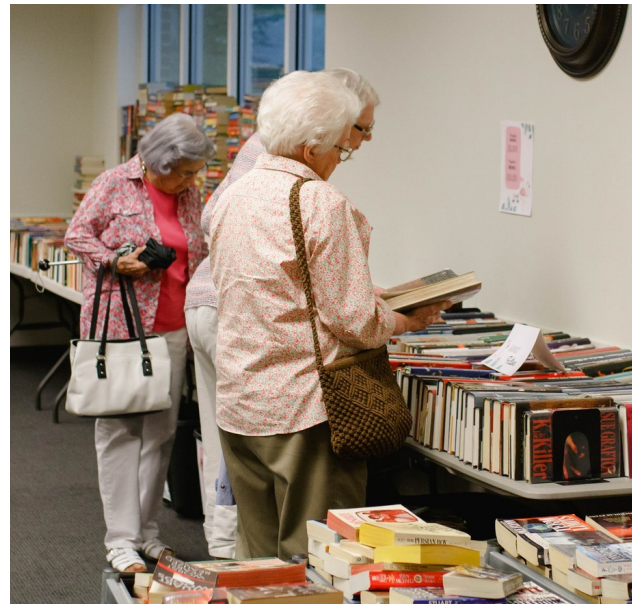
These ladies earned a free book for wearing a floral shirt to the Flamingle.