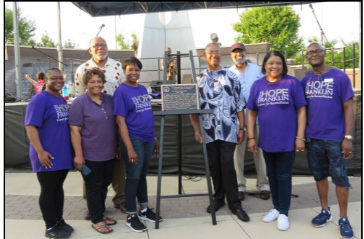
John Hope Franklin dedication ceremony in Reconciliation Park in Tulsa was held on May 31, 2018.

Woody Guthrie was the first Oklahoma Literary Landmark honoree in 2001. In 2009, a rededication ceremony was held and the plaque was installed.