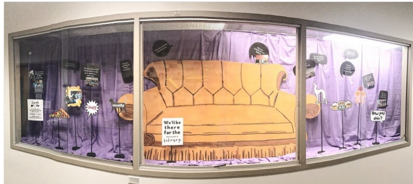
Grove Public Library Friends arranged a very elegant display.