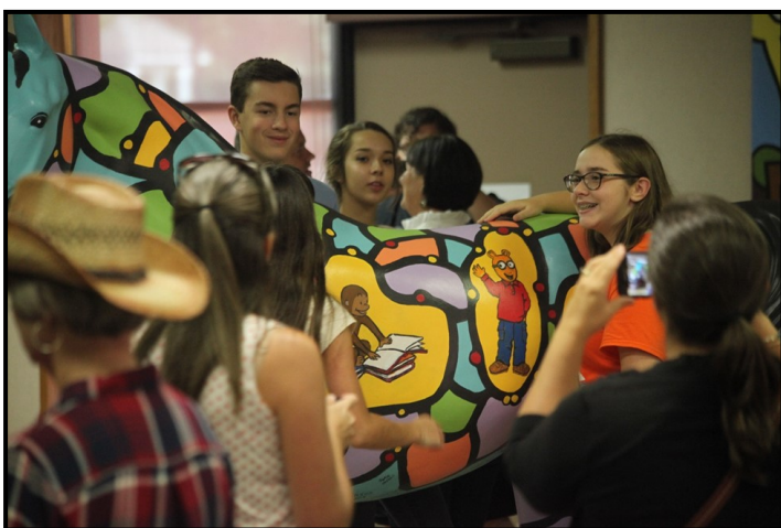
Story Dancer, Shawnee Library's “Horse of a Different Color.”

Another competition ensued to name the newly painted horse, choosing from a limited number of selections. Of the 800 votes cast, "Story Dancer" emerged as the overwhelming favorite. Story Dancer, was dedicated in October and now stands in a small garden area at the northwest corner of the library.