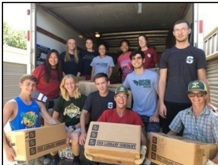
Shawnee High School Honor Society students load boxes for the annual Shawnee Friends' book sale this past October

The Shawnee Friends had a very successful annual book sale this past October, grossing over $4,000 in the one full day and two half-days of the event. One of the half-day sales broke the single day record, grossing over $2,000.