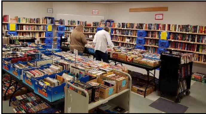
The FOHL popular book sale is shown above.

The Friends of the Helmerich Library (FOHL) was formed in 2001 with only three members. This small group held its first book sale about a year later, making $1200 and was excited to have the funds to provide extra support to the Peggy Helmerich branch of Tulsa City/County Library System. In April 2004 the first full-scale book sale was held and has been held annually (except in 2013) since that time. All our fundraising is through the annual book sale.