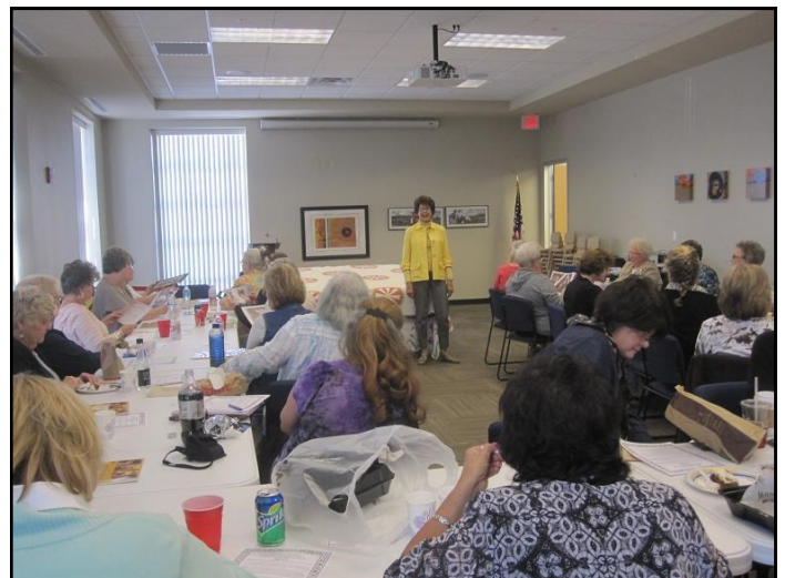
The Mustang Public Library's meeting room is one of the great new spaces with their addition.