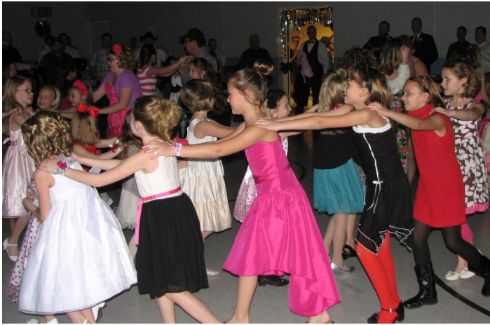
The Conga Line at the Daddy Daughter Dance.

The Purcell Friends hold two book sales each year, which are successful, raising about $1,200-$1,400 each. The Friends of the Library volunteer and help at library programs throughout the year.