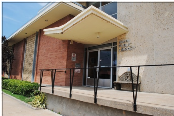
Miami Public Library