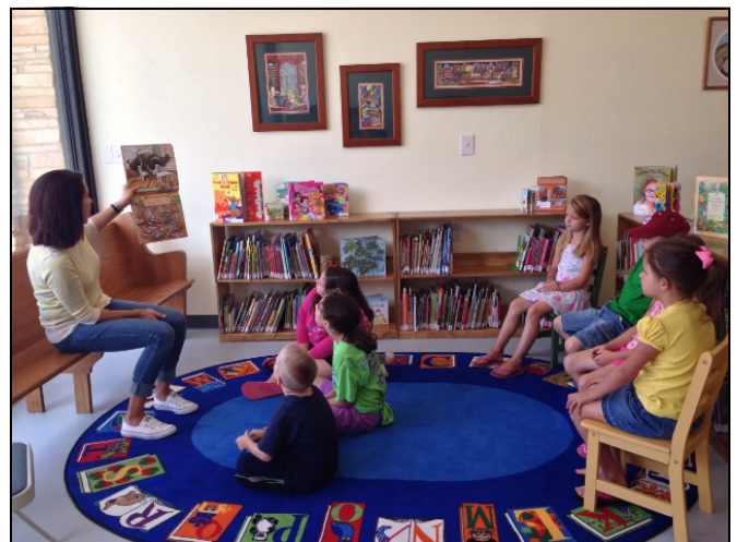
Storytime at the new Tuttle Public Library has some library attendees riveted.