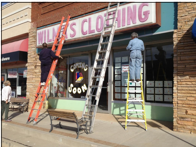
Volunteers worked on the new storefront library. More than 4,500 hours were volunteered to make the library a success.