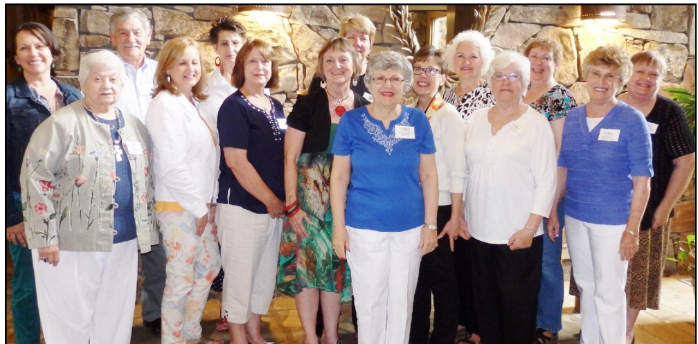
Pictured are Board members and Advisory Board members attending the June retreat.