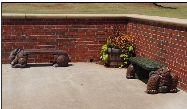
A renewed inviting patio at Blanchard PL.

The Blanchard Friends of the Library held their annual membership meeting on Tuesday, September 16. The Friends have been busy with book sales and collecting receipts for the Spencer Supermarket fundraiser, and have added the AmazonSmile Foundation fundraiser.