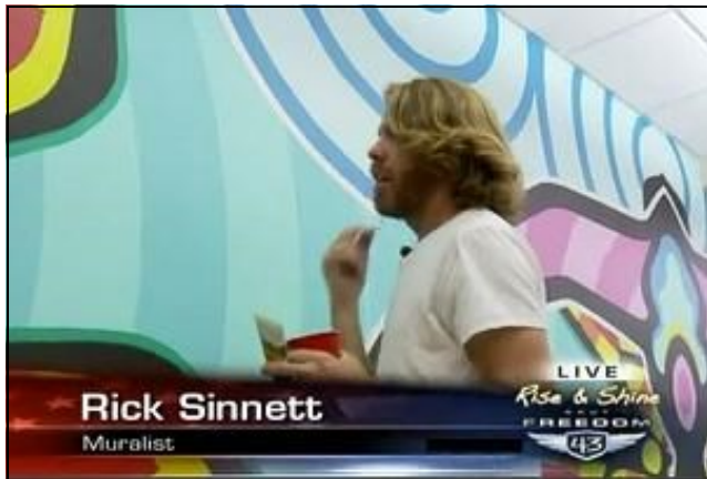
Photo of muralist at work at the Mustang Public Library from the Channel 43 news. Thanks to the Okla. Dept. of Libraries for technical assistance.