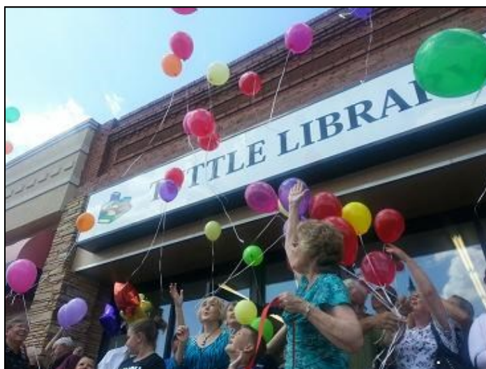
The Tuttle Library opened on May 21 and celebrated with the Grand Opening on Sunday, August 17 with a ribbon-cutting ceremony and a balloon launch.